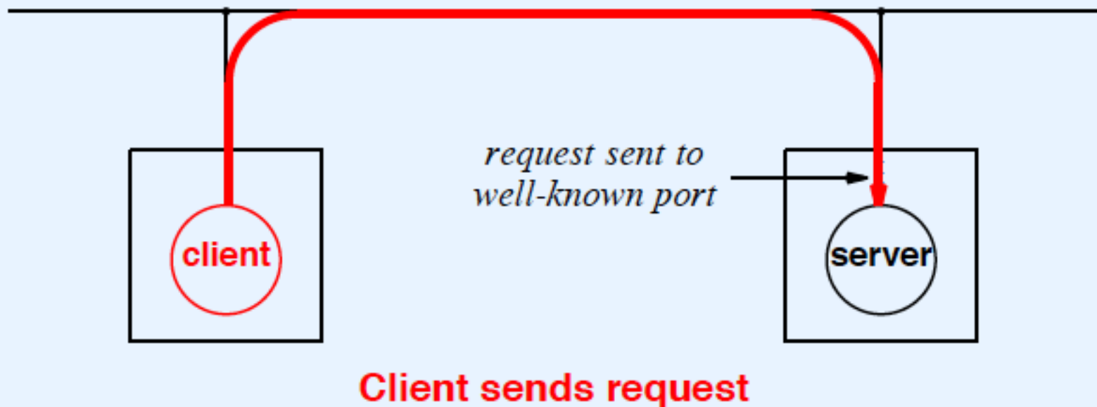
Illustration Of The Client-Server Paradigm